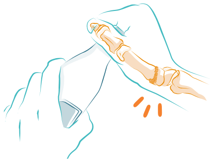
Difficulty grasping everyday objects?